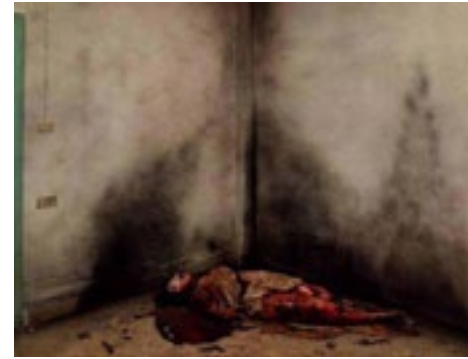
Taryn Simon, Zahra/Farah, 2007, chromogenic print

The Austrian Pavilion featured the work of Markus Schinwald who negotiates the representation and manipulation of space, time, light, and shadow. He not only alters our experience of space through a moment of disturbance, but also uses the pavilion's architecture and history with all its ruptures, rifts, and blemishes making it his subject. Through the use of suspended walls Schinwald forces visitors to consider the significance of human legs in body language. The Pavilion was proved one of the highlights during the opening week of the Biennale.