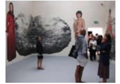
Cindy Sherman, installation view

I regret missing a vast majority of the events parties and exhibitions, but there are many things to see, and events taking place simultaneously