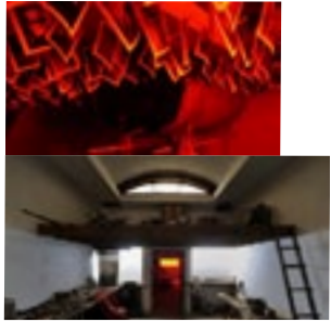
Mike Nelson, I, Impostor, 2011, interior detail

workshop or a Turkish slum. Tools and benches, concrete floors and strip lighting, filthy mattresses and ancient trellis glowing in the windowless gloom, the atmosphere reflects impoverished and unseen lives. Each mise en scène is conspicuously designed to evoke claustrophobia, bewilderment and unease. Nelson exceeds the spectacle of his flawless craftsmanship to transport one to another chamber of the mind.