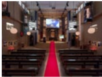
Christoph Schlingensief, A Church of Fear vs. the