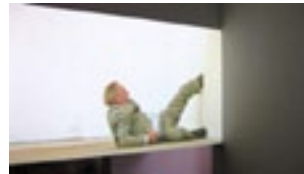
Markus Schinwald, Orient, 2011, video

The Austrian Pavilion featured the work of Markus Schinwald who negotiates the representation and manipulation of space, time, light, and shadow. He not only alters our experience of space through a moment of disturbance, but also uses the pavilion's architecture and history with all its ruptures, rifts, and blemishes making it his subject. Through the use of suspended walls Schinwald forces visitors to consider the significance of human legs in body language. The Pavilion was proved one of the highlights during the opening week of the Biennale.