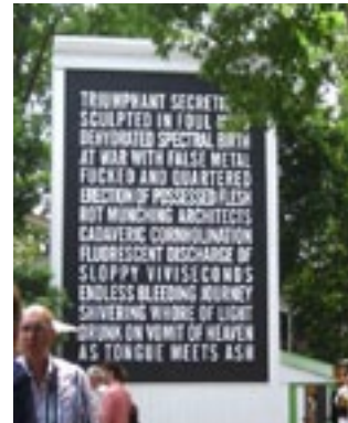
Steven Shearer, 2011, installation view

"Squeezed between the British and German pavilions is Canada. Oh Canada, what happened? Steven Shearer is a darling of the international scene, ...many international colleagues asking me to explain the pavilion, I tried hard to find positive aspects, yet all I could muster was the idea that a once-in-a-lifetime site-specific project, instead of a conservatively-presented gathering of commercially viable creations, could have been far more compelling."